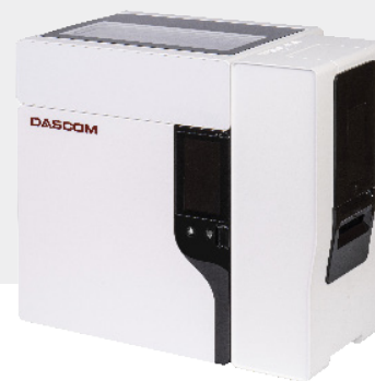
Double bin model